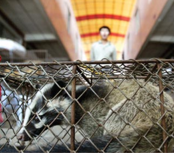
COUNTRY: China VIRUSES PREVIOUSLY SPAWNED: SARS, H5N1 SENTINEL POPULATION: "Wet market" workers