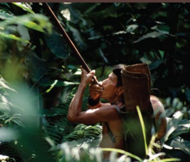
COUNTRY: Malaysia VIRUSES PREVIOUSLY SPAWNED: Nipah SENTINEL POPULATION: Wildlife hunters