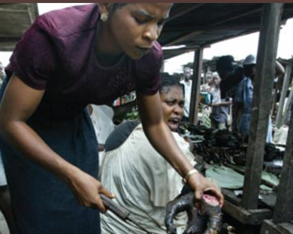
COUNTRY: Democratic Republic of the Congo VIRUSES PREVIOUSLY SPAWNED: Marburg, monkeypox, Ebola SENTINEL POPULATION: People who hunt and butcher wild animals