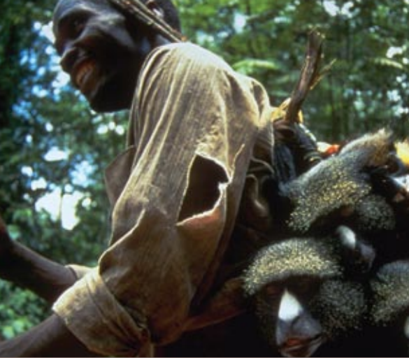
COUNTRY: Cameroon VIRUSES PREVIOUSLY SPAWNED: HIV SENTINEL POPULATION UNDER STUDY FOR NEW PATHOGENS: People who hunt and butcher wild animals